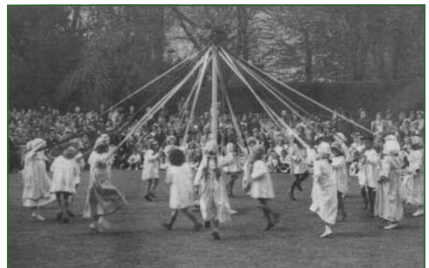
Maypole Dancing 1950's at St. Peter's School, Earley